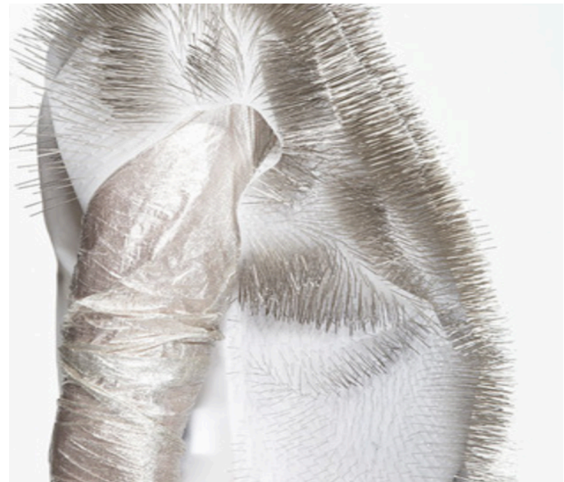
Yin Gao's Sound Dress